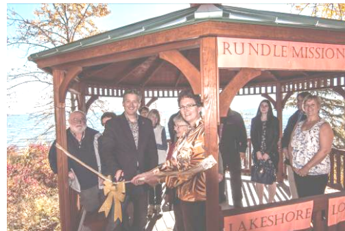
Blaine Calkins MP opens the Lakeshore Lookout as Board members and friends of the Society look on

ON October 10, 2014 Blaine Calkins MP officially opened the wheelchair accessible gazebo overlooking Pigeon Lake. Friends, directors, and staff gathered on a beautiful fall day to celebrate and congratulate each other on two years of planning, fundraising and cooperation to complete a project we can all be proud of. This is a treasure for our community